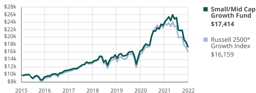
Chart indicates since inception performance.