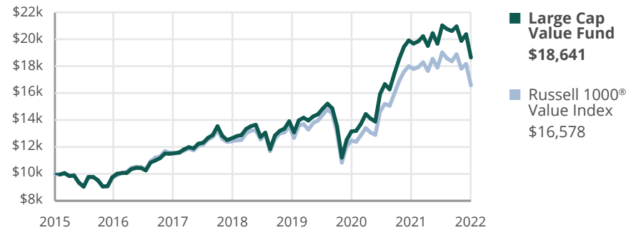
Chart indicates since inception performance.