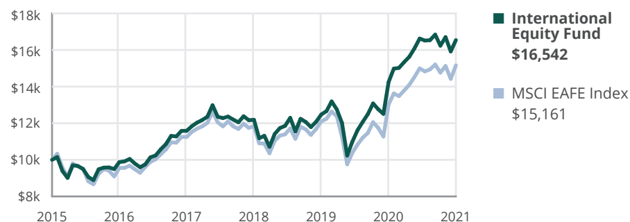
Chart indicates since inception performance.