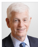
MARIO J. GABELLI, CFA Chief Executive Officer GAMCO Investors, Inc.