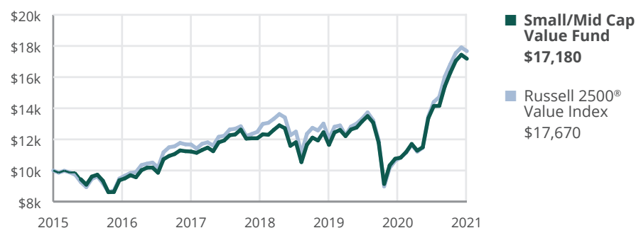
Chart indicates since inception performance.