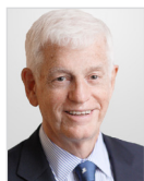
MARIO J. GABELLI, CFA Chief Executive Officer GAMCO Investors, Inc.