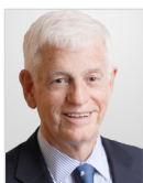
MARIO J. GABELLI, CFA Chief Executive Officer GAMCO Investors, Inc.